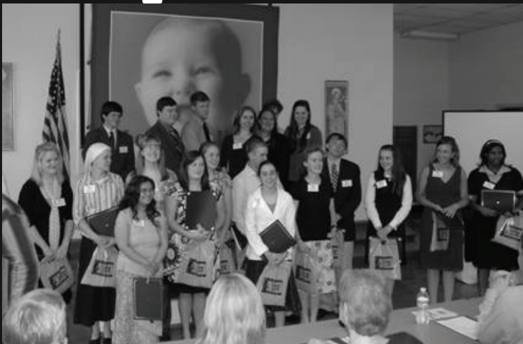
Tennessee Right to Life Pro-Life High School Oratory Contest 2009 State Finalists

AQUINAS COLLEGE IN THE DOMINICAN TRADITION Saturday, May 1, 2010 Aquinas College Nashville